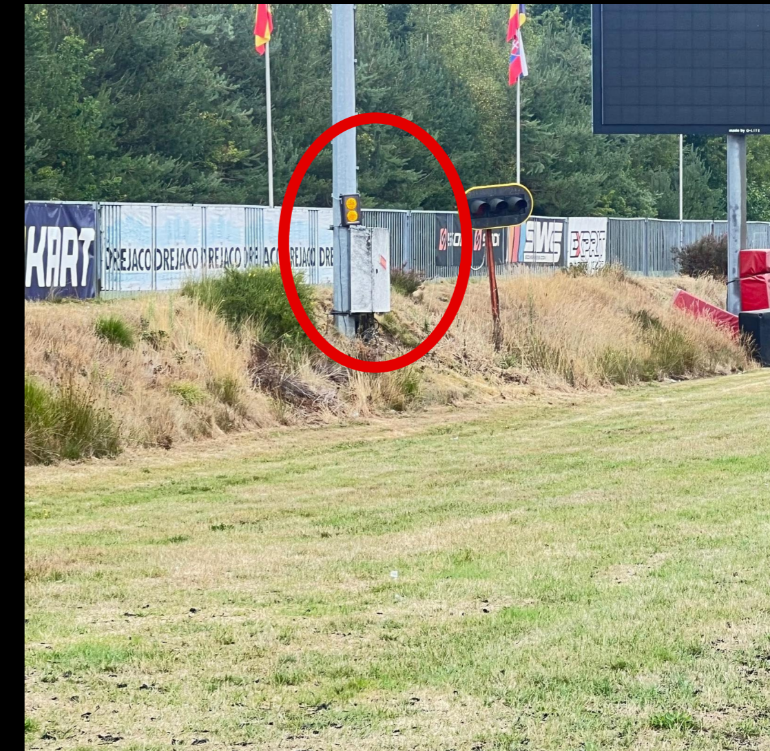
Orange Flashing Light REPEATER