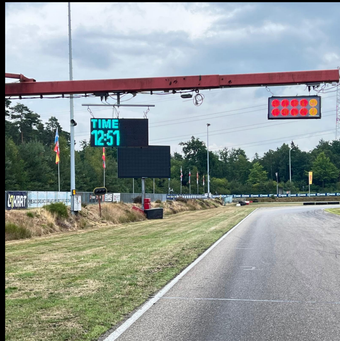
Orange Flashing Light