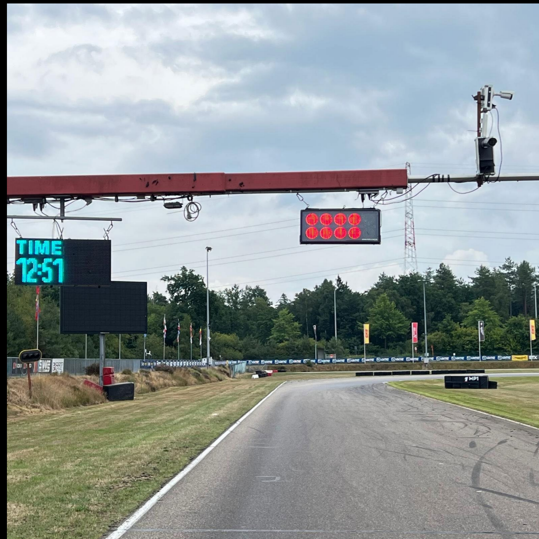
Picture of RED lights ON

RED lights & Orange flashing light are ON. One extra formation lap.